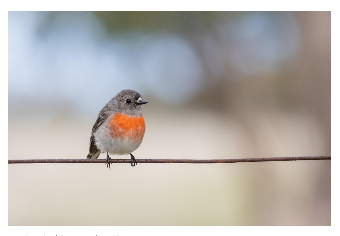
Scarlet Robin

A complementary project seeks to estimate the landscape-scale bird biodiversity dividend of Holbrook Landcare Network and Murray Local Land Services projects. Through analysis of projects that included dense plantings, model-based estimates of the woodland-bird biodiversity dividend are being prepared and will be presented to the Department of Agriculture, Forestry and Fisheries as a case study, by the Holbrook Landcare Network in 2023.