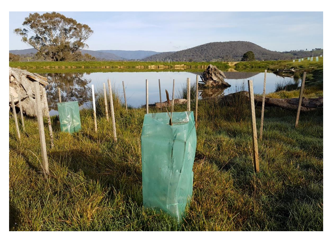
Revegetation around a farm dam, Mansfield, Victoria