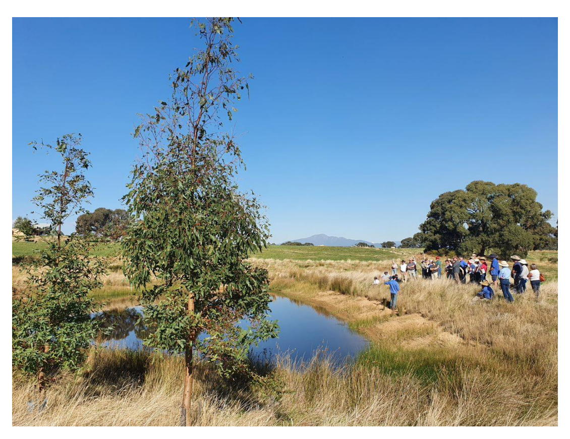
Enhancing farm dams field day, Merrijig, Victoria

In addition to outreach events, the Sustainable Farms field staff provided personalised advice to at least 140 landholders this year. This is typically provided during farm visits for ecological surveys and topics include fauna and flora identification, technical advice for natural asset management, and support in seeking funding for on-farm projects.