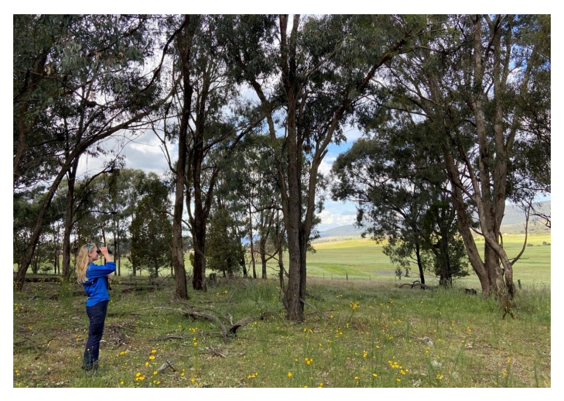
Bird survey in remnant on-farm vegetation

In 2022 we continued our long-term ecological monitoring on farms, including monitoring biodiversity, vegetation and water quality. 2706 biodiversity surveys were completed on 167 properties. Our research findings are published in leading academic journals (Appendix 2).