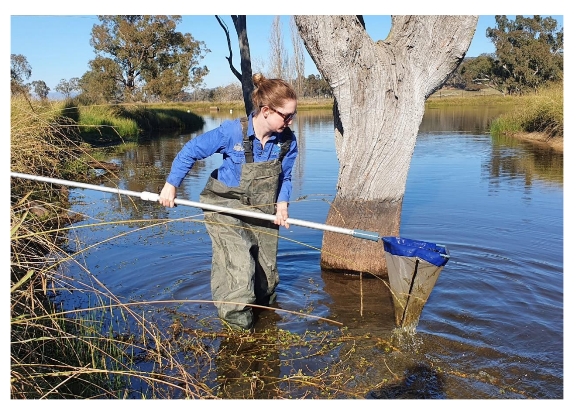
Collecting aquatic macroinvertebrates from an enhanced farm dam

To supplement the farm dams' project, Sustainable Farms is supporting PhD research into frogs in farm dams. The objective of this study is to examine the relative influence of the potential drivers of frog and tadpole distribution throughout highly modified agricultural landscapes. This study specifically focuses on how dam management interventions influence amphibian populations and found that they were more likely to occur in dams that been fenced to limit livestock and had been revegetated or allowed vegetation to naturally regenerate.