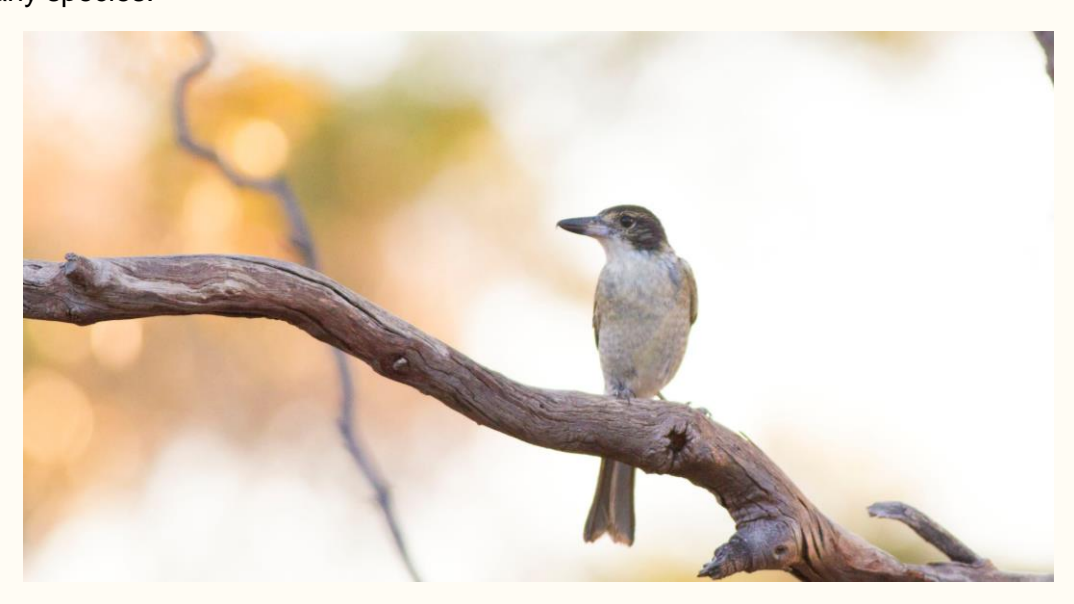
Grey Butcherbird

Many species are continuing to decline; however, this research provides important evidence of the specific management practices that can help contribute to the conservation and recovery of many species.