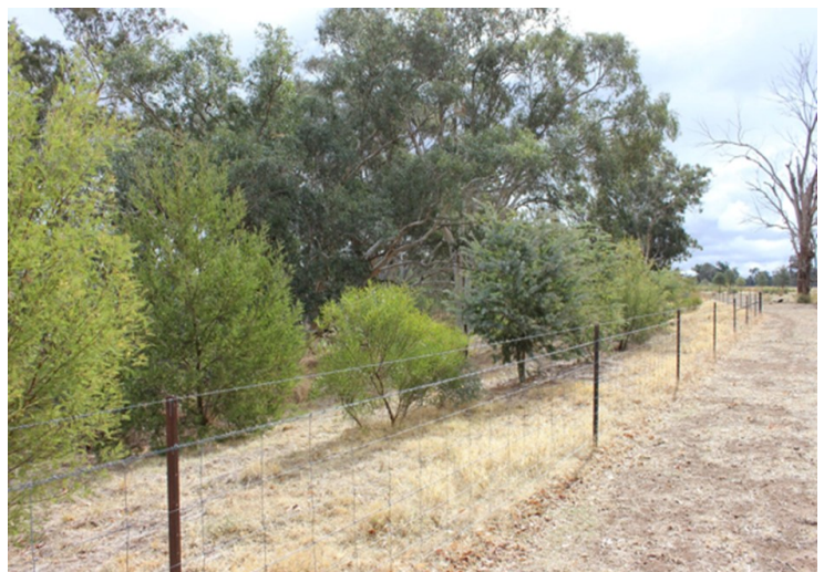
Shelterbelt with shrubs and grassy habitats on the edges

A diversity of species has benefits for wildlife. Include plant species that flower at different times of the year. The incorporation of large old trees into shelterbelts significantly increases their biodiversity value, as they provide additional wildlife resources, such as hollows and more reliable food supplies.